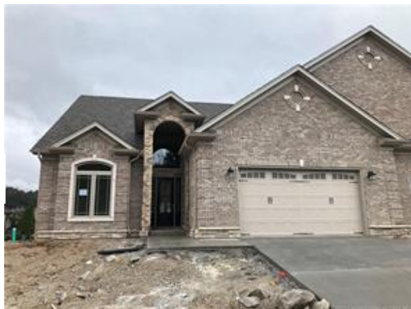
1 / 12

Welcome to the Richmond that is almost finished in prestigious Quarry Bluff! Only steps away from the communities private lake and beach! This luxurious home is situated on a quiet cul-de-sac with a covered porch with a secluded back yard to settle down and read your favorite book! Your guests will marvel as they enter the expansive foyer that flows right into the great room, which adjoins the open kitchen area. The owner’s retreat is nestled away from the remaining bedrooms for quiet relaxation. The master suite also features an oversized spa shower, free standing tub and large walk-in closet – all to make this home as comfortable for you as possible. The other bedrooms have easy access to a shared full bath. Large windows allow natural light, further enhancing the airy feel of this sunny, well-designed home. Go on vacation without ever leaving Southern Indiana. Experience all the amenities of resort style living right in your backyard! Included in the community is a pool with a clubhouse, private clear quarry with a sandy beach, and tennis courts. Located just 3 minutes from I-265 highway 15-20 minutes from Downtown Louisville!