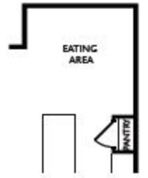
OPTIONAL PANTRY #1